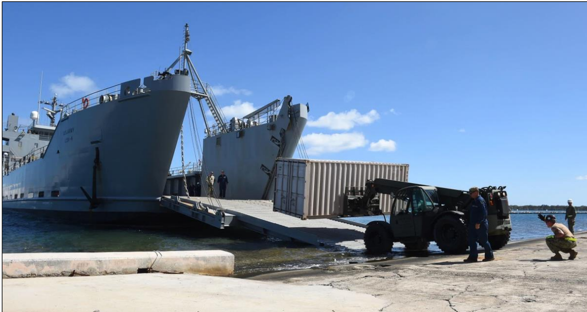
Figure 3. Besson-Class Logistics Support Vessel (LSV)

Source: Cropped version of photograph accompanying Walker D. Mills and Joseph Hanacek, “The US Navy and Marine Corps Should Acquire Army Watercraft,” Defense News , June 22, 2020. The caption to the photograph credits the photograph to the U.S. Navy and states, “U.S. Navy sailors conduct a simulated disaster relief supply offload from a General Frank S. Besson-class logistics support vessel at Joint Base Pearl Harbor-Hickam on July 10, 2016.”