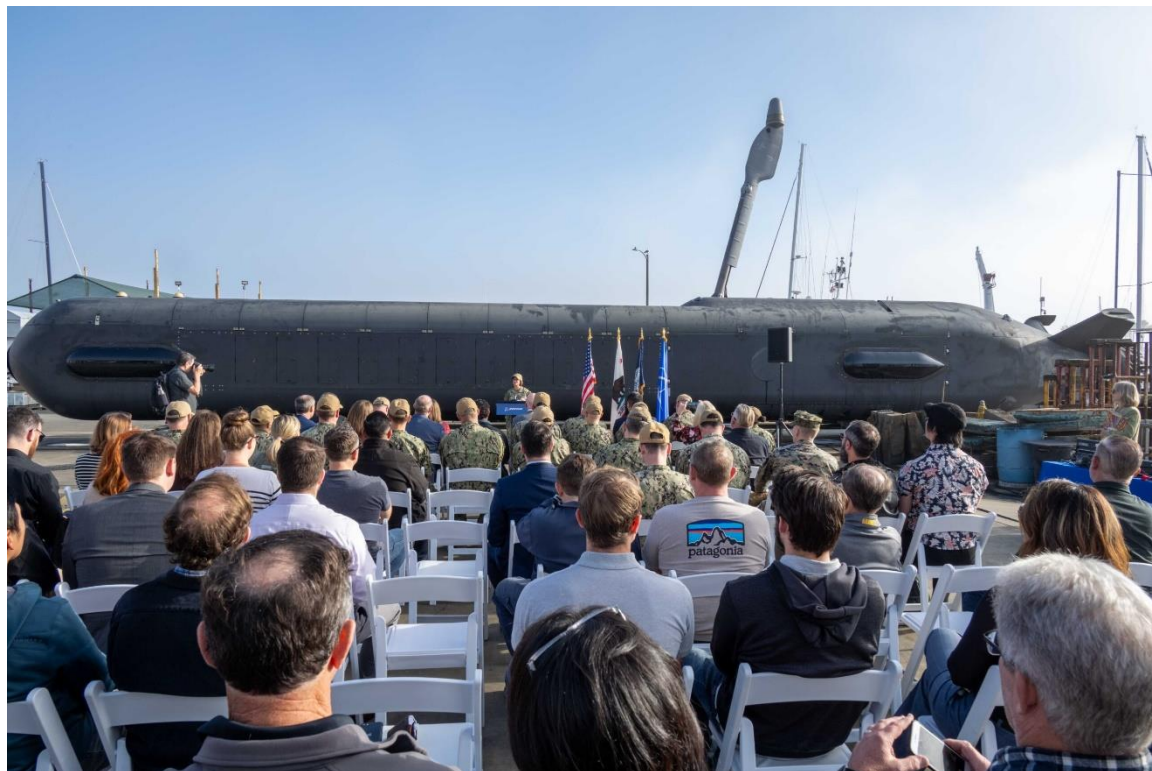
Figure 9. XLUUV (Orca)