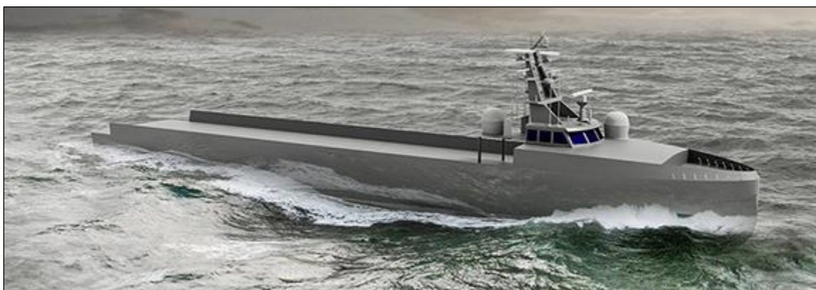
Figure 6. Rendering of L3Harris Design Concept for MUSV