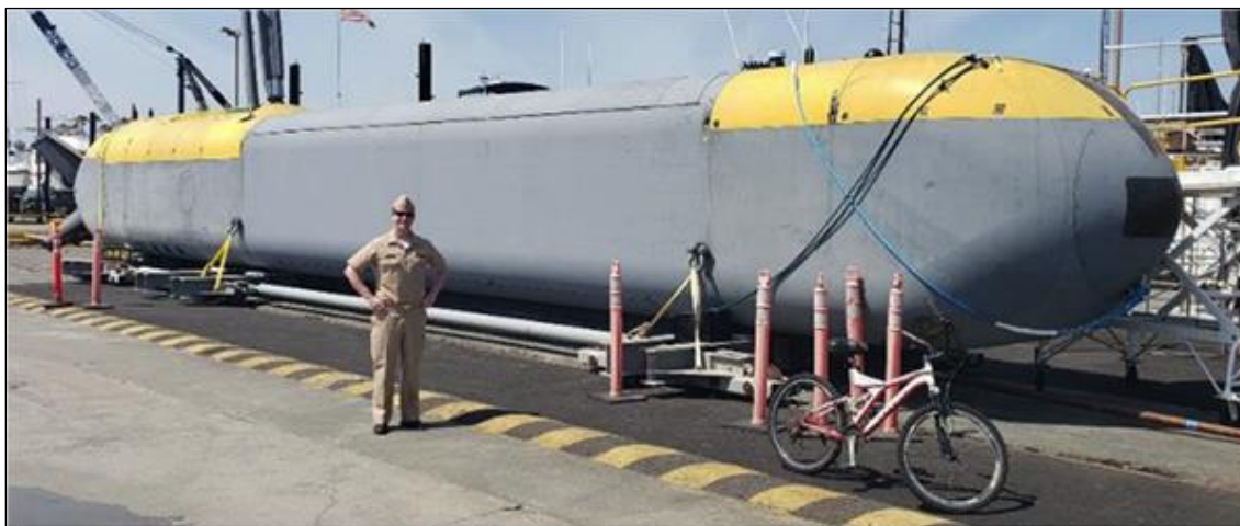
Figure 12. Boeing Echo Voyager UUV