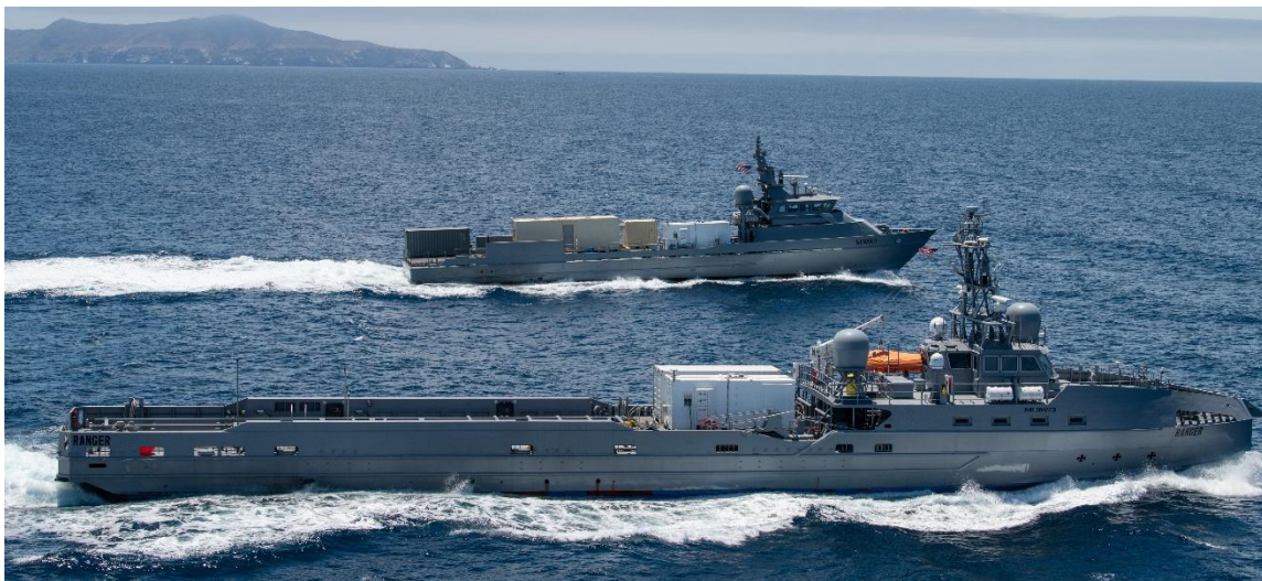
Figure 3. USV Prototypes