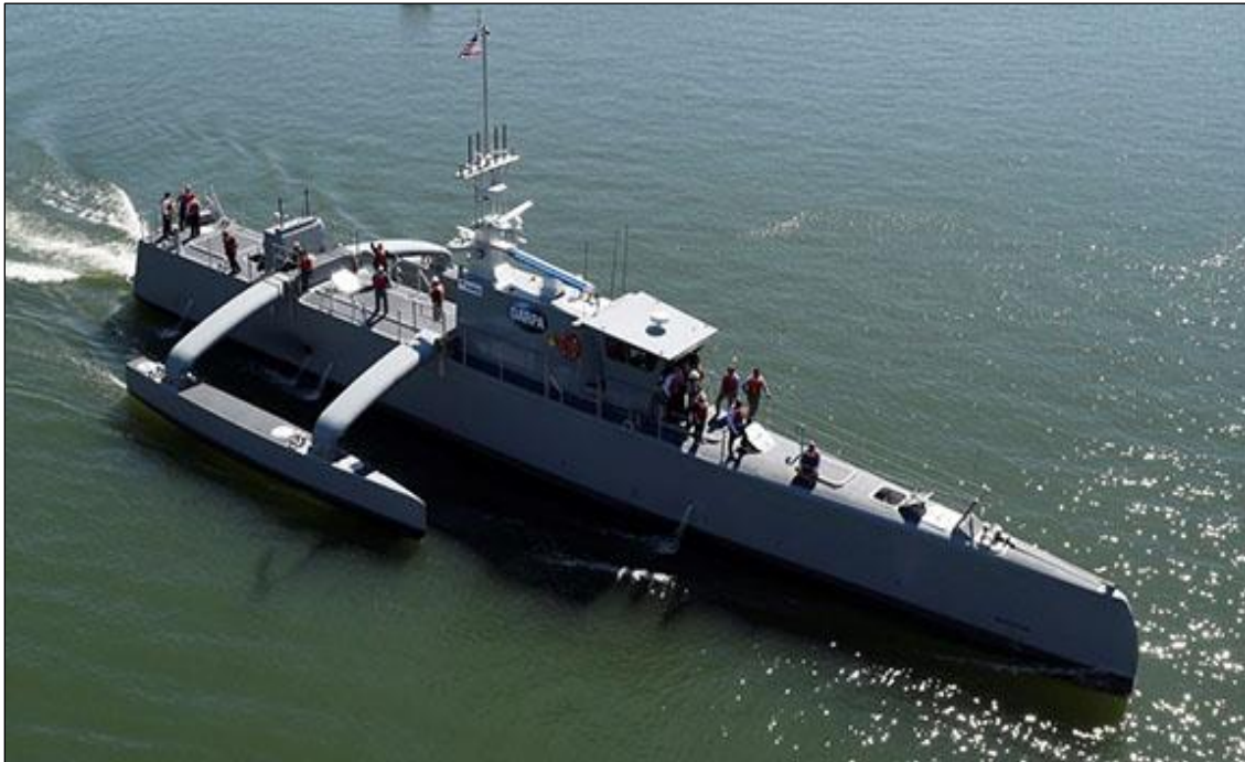
Figure 2. Sea Hunter Prototype Medium Displacement USV

Source: Photograph credited to U.S. Navy accompanying John Grady, “Panel: Unmanned Surface Vessels Will be Significant Part of Future U.S. Fleet,” USNI News , April 15, 2019.