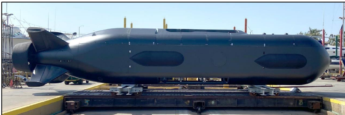
Figure 8. XLUUV (Orca)