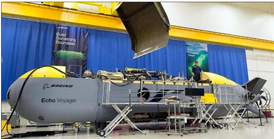
Figure 11. Boeing Echo Voyager UUV