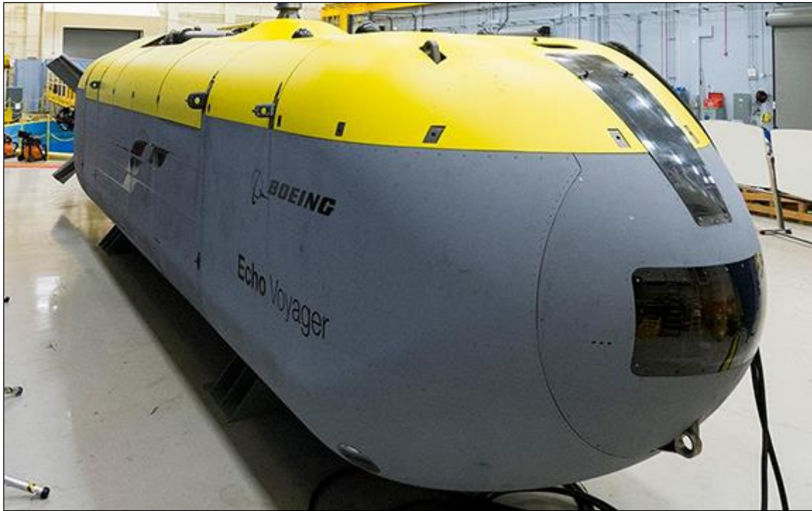
Figure 10. Boeing Echo Voyager UUV